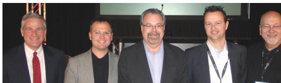
Global Specialty Lens Symp 1/26-29/12.

As in the past, the meeting has traditional lectures as well as hands-on demonstrations with cutting-edge products, scientific papers, and posters. www.GSLSymposium.com .