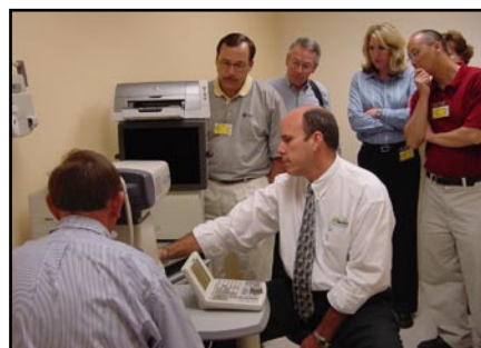
AOCLE attendees observing the Marco automated lanes