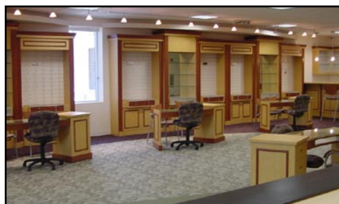
The Optical Dispensary