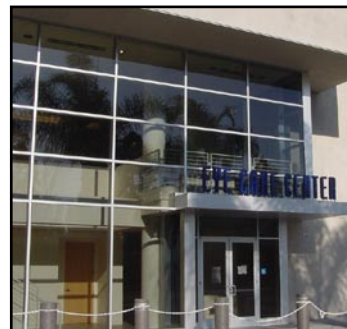
The Eye Care Center

advancements, including internet access in every examination room, remodeled faculty offices with modern furniture, an impressive and inviting optical dispensary and fully automated lanes. The new facilities will house a laser refractive center on its second floor. The clinic will sure be the envy of schools and colleges of Optometry around the world !