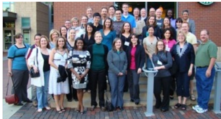
Our future contact lens leaders: the CL Residents

Bausch and Lomb Educators Meeting January 27-28, 2010